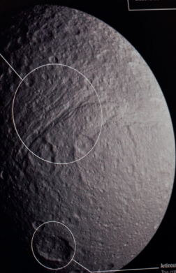
Chasma Chasma This 1,230km (757-mile-) long canyon system is about 100km (60 miles) wide.