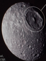
Herschel Crater Mountain peaks, 6km (4 miles) high, are visible in the crater's center.

Mimas is the innermost and smallest of Saturn's major moons. It orbits within the ring system and cleared the region between the A and B rings to produce the Cassini Division. This ball of water ice and rock averages 397km (247 miles) in diameter. But Mimas is not quite spherical: it is about 30km (19 miles) longer than it is wide and deep. The moon's surface is an icy -209°C (-344°F) and is pitted by impact craters. The huge Herschel Crater dwarfs all the rest. It is Mimas's most conspicuous surface feature, at 139km (86 miles) wide and almost 10km (6 miles) deep. The crater takes its name from William Herschel, the British astronomer who discovered the moon in 1789.