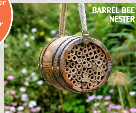
BARREL BEE NESTER

SKU: BARNB BARCODE: 679505023397 DIMENSIONS: 230 x 185 x 185 mm TRADE PRICE: £10.85 SSP: £24.99