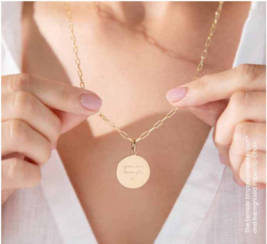
The Female Empowerment Popon® and Recognised Paperclip Chain