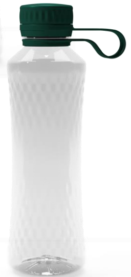
Hyde Park Green