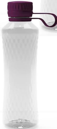
Notting Hill Violet