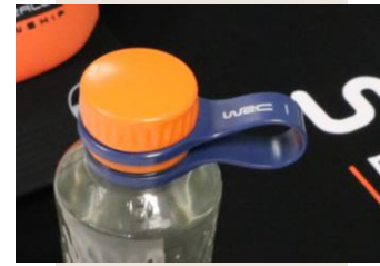
printed strap and custom colours