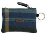
BLUE CHECK HTCP08