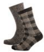
GREY BOX / GREY MARL SOCK20