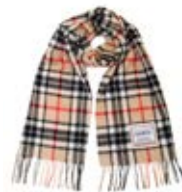
CAMEL THOMSON CIG9-HT