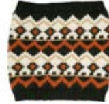
MUSHROOM / ORANGE NW04