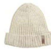
OATMEAL UNION JACK HAT-394UJ