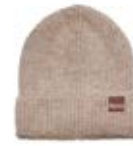
PEBBLE MARL HAT-441