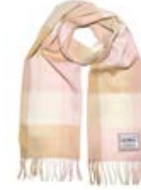
CAMEL ROSE CIG51-HT