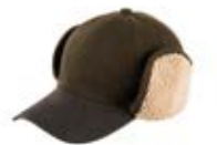
OLIVE FELT HAT-580