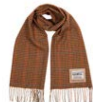
ANTIQUE HOUND SCAR-226