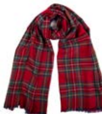
ROYAL STEWART CIGST12