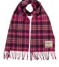
PLUM / ROSE CHECK CIG17-HT