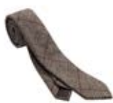
PRINCE OF WALES-GREY TIE08