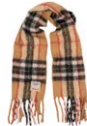
CAMEL THOMSON SCAR-111