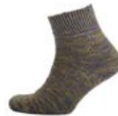
BLUE GREEN SOCK25