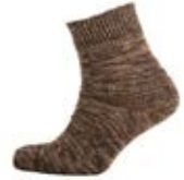
BROWN STONE SOCK24