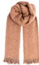
BLUSH BOUCLE SCAR-161