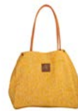
DONEGAL YELLOW BAG HTTB02