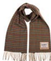
PETROL RUST SCAR-222