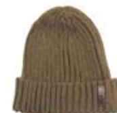
BROWN UNION JACK HAT-393UJ