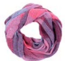
PINK / GREY SNOOD19