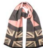
BLUSH UNION JACK SCAR-83