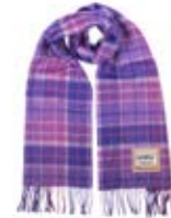
PURPLE BUCHANAN CIG18-HT