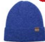
OCEAN BLUE HAT-684