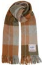
WOODLAND CHECK CIG41-HT