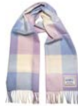
LILAC ROSE CIG50-HT