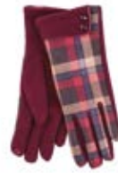
OXBLOOD CHECK GLOVE18