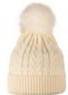
WINTER WHITE CABLE HAT-540