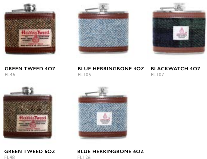
GREEN TWEED 4OZ FL46