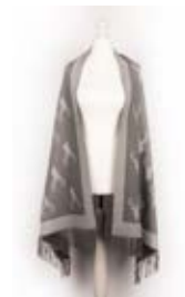
STAG GREY SCAR-208