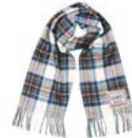
DRESS BLUE STEWART CIG11-HT