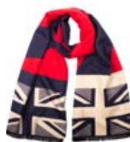
UNION JACK SCAR-36