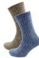
BLUE / OATMEAL SOCK57