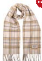
SOFT GREY / GOLD CIG70-HT