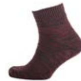
BURGANDY / BLACK SOCK22