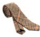
CAMEL HOUNDSTOOTH TIE11