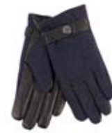
NAVY HERRINGBONE GLOVE40