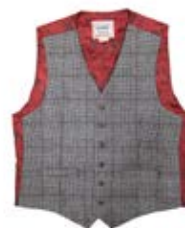
PRINCE OF WALES-GREY WAIST04 M/ L/ XL