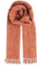
GINGER BOUCLE SCAR-159