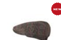
KIDS PRINCE OF WALES HAT-651SM / HAT-651ML