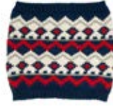
NAVY / RED NW03