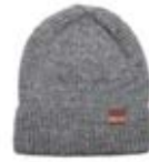
GREY MARL HAT-440