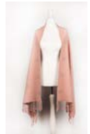
BUSY BEE PINK SCAR-202