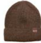
MUSHROOM MARL HAT-443