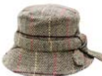
BROWN BOX HAT-332