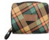
GREEN CHECK HTSP04