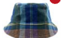
BLUE CHECK HAT-662