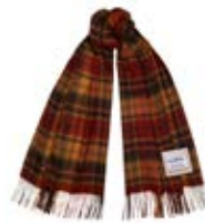
ANTIQUÉ BUCHANAN CIG5-HT