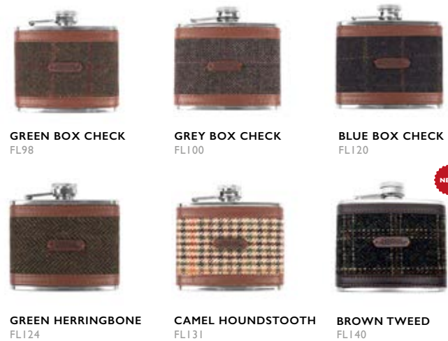
GREEN BOX CHECK FL98