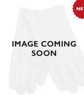
PETROL RUST GLOVE70