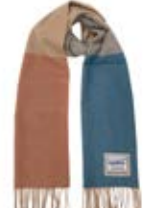
RUST / BLUE SCAR-225