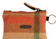
CAMEL CHECK HTCP09