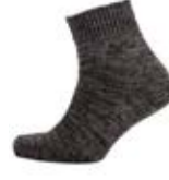
CHARCOAL GREY SOCK23