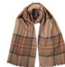
NATURAL STEWART CIGST13