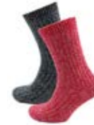
RED / CHARCOAL SOCK58