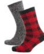
RED CHECK / CHARCOAL SOCK21