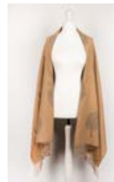
MULBERRY GREY SCAR-184