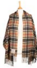
CAMEL THOMSON CIGST04