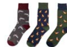
SALMON/ STAG / PHEASANT SOCK27