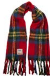
ROYAL STEWART SCAR-110