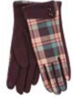
BROWN CHECK GLOVE20