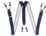
NAVY SPOT HTBR02