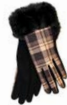
BLACK FUR TRIM GLOVE31