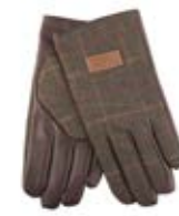
GREEN BOX CHECK GLOVE14