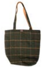
FOREST GREEN SHOPPER HTSH03