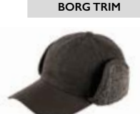
CHARCOAL FELT HAT-579