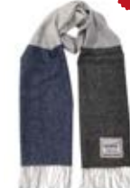
NAVY / GREY SCAR-224