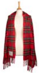
ROYAL STEWART CIGST03