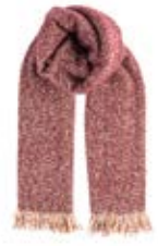
WINE BOUCLE SCAR-160