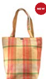
CAMEL CHECK SHOPPER HTSH05