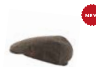
KIDS GREEN BOX HAT-650SM / HAT-650ML