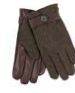
GREEN HERRINGBONE GLOVE41