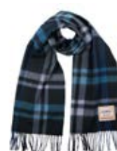
NAVY CHECK CIG3-HT