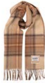
NATURAL STEWART CIGD01