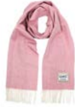
ROSE PINK SCAR-127