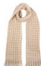
OATMEAL CHECK CIG67