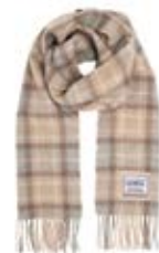
MACKELAR NATURAL CIG37-HT