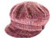
BRUSHED PINK HAT-279