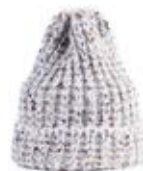
DONEGAL PEBBLE HAT-445