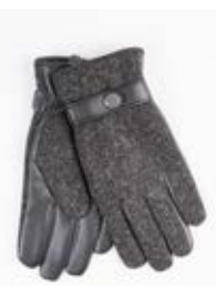
BLACK MELANGE GLOVE66