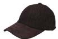
BROWN HERRINGBONE HAT-201