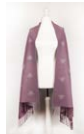
BUSY BEE PURPLE SCAR-200