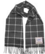
CHARCOAL BOX CHECK CIG54-HT