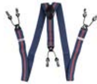
NAVY STRIPE HTBR01