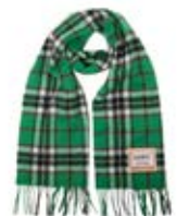
EMERALD THOMSON CIG26-HT