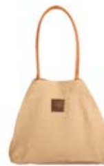
TAN CANVAS BAG HTTB01