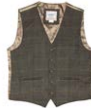
GREEN BOX CHECK WAIST02 M/ L/ XL