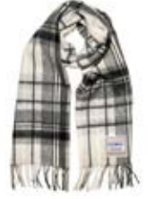
BLACK/WHITE CHECK CIG49-HT