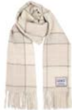
NATURAL BOX CHECK CIG42-HT