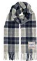
BANNOCK TARTAN CIG36-HT