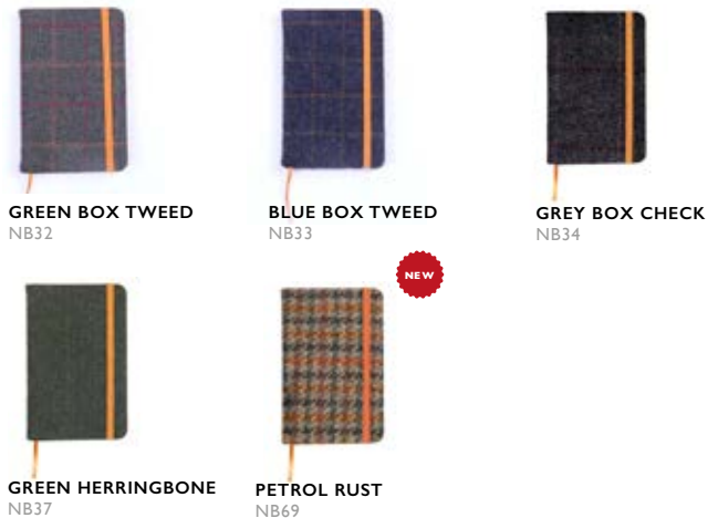
GREEN BOX TWEED NB32