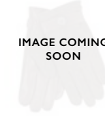
BROWN HERRINGBONE GLOVE73