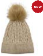
OATMEAL CABLE HAT-656