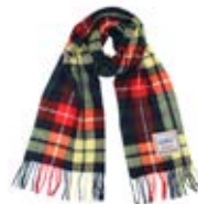
MODERN BUCHANAN CIG28-HT