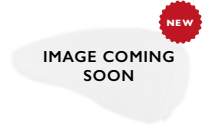
JUMBO HERRINGBONE - BROWN HAT-669