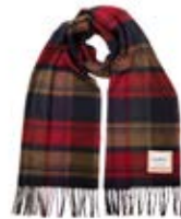
RED / NAVY / GOLD CIG72-HT