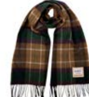
COUNTRY PURPLE CIG73-HT