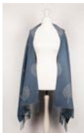
MULBERRY BLUE SCAR-190