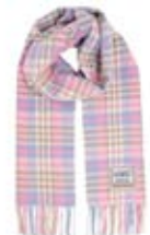
DOLLY MIXTURE CIG39-HT