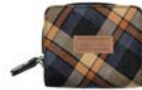
NAVY CHECK HTSP02