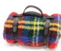
ROYAL STEWART BL75