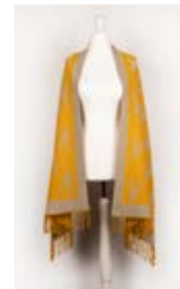
STAG YELLOW SCAR-206