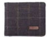
BLUE BOX CHECK WALLET07