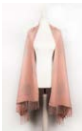
MULBERRY PINK SCAR-188