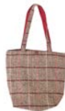
CAMEL SHOPPER HTSH01