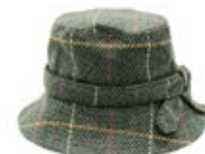
GREEN BOX HAT-333