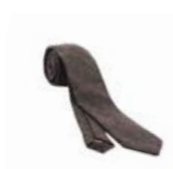
GREY BOX CHECK TIE06