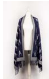
STAG BLUE SCAR-205