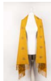
BUSY BEE TURMERIC SCAR-199