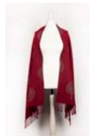
MULBERRY OXBLOOD SCAR-187