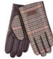
CAMEL HOUNDSTOOTH GLOVE17