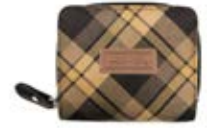
BROWN CHECK HTSP03