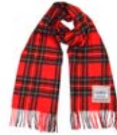
ROYAL STEWART CIG7-HT