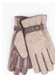
CAMEL MELANGE GLOVE64