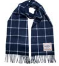
NAVY BOX CHECK CIG52-HT