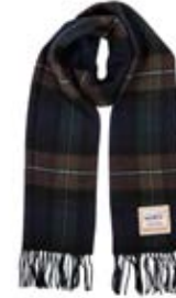
MIDNIGHT CHECK CIGD02