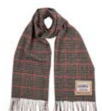
GREY / RED SCAR-220