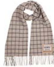
NAVY / GREY SCAR-219