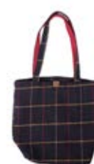
NAVY SHOPPER HTSH02