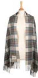
DRESS BLUE STEWART CIGST01