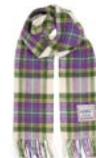
HEATHER TARTAN CIG38-HT