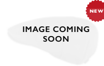
JUMBO HERRINGBONE-GREY HAT-668