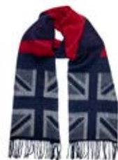
UNION JACK CIG57