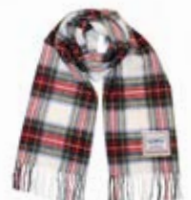
DRESS STEWART CIG22-HT