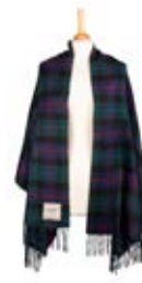
CAMPBELL OF CAWDOR CIGST02