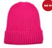
HOT PINK HAT-654