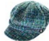
BRUSHED BLUE HAT-280