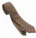
PETROL RUST TIE09