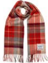
RUSSET CHECK CIG45-HT