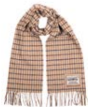
NAVY / TAN SCAR-179