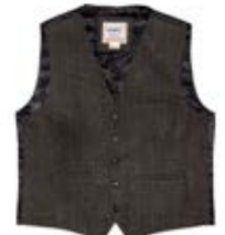
GREY BOX CHECK WAIST03 M/ L/ XL