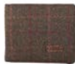
GREEN HERRINGBONE WALLET04