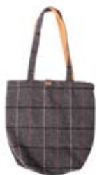
SLATE GREY SHOPPER HTSH04