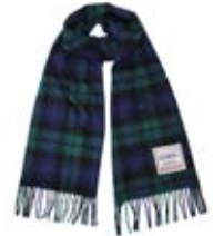
BLACK WATCH CIG20-HT