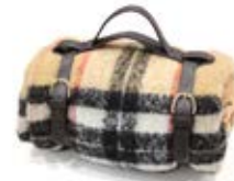
CAMEL THOMSON BL85