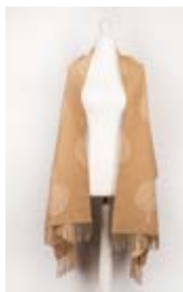
MULBERRY CAMEL SCAR-189