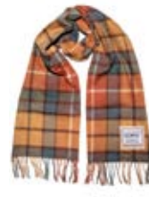
AUTUMN CHECK CIG48-HT