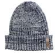
NAVY UNION JACK HAT-392UJ