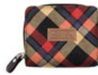
OXBLOOD CHECK HTSP01