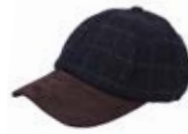
BLUE BOX CHECK HAT-199