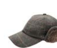
GREEN BOX CHECK HAT-316