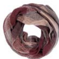
BROWN / BEIGE SNOOD16