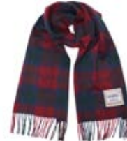
LINDSEY TARTAN CIG23-HT