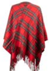
ROYAL STEWART CIGSER04