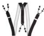
BLACK SPOT HTBR04