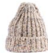
DONEGAL OATMEAL HAT-446