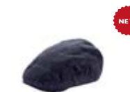
KIDS BLUE BOX HAT-649SM / HAT-649ML