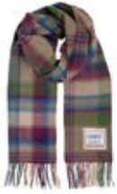
HERITAGE CHECK CIG40-HT