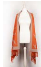
STAG ORANGE SCAR-203