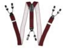
WINE SPOT HTBR03