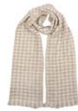
SILVER DOGTOOTH CIG68