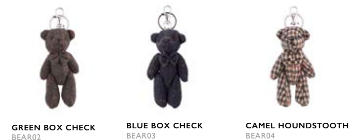
GREEN BOX CHECK BEAR02