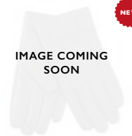
PRINCE OF WALES GLOVE71