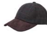
GREEN BOX CHECK HAT-200