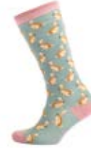
AQUA HARE SOCK44