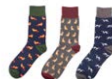
FOX / HARE / HOUND SOCK28