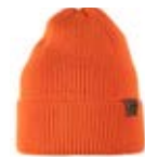
HUNTING ORANGE HAT-554