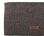
GREY BOX CHECK WALLET05