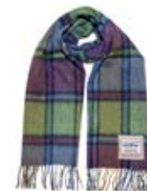
HERITAGE CHECK CIG55-HT