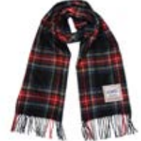
BLACK STEWART CIG24-HT