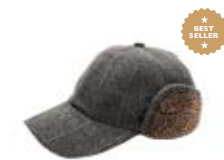
GREY HERRINGBONE HAT-315