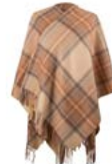
NATURAL STEWART CIGSER03