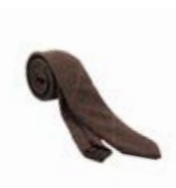
GREEN BOX CHECK TIE02