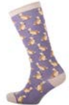
LILAC HARE SOCK46