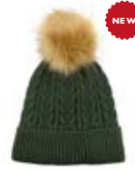
KHAKI CABLE HAT-657