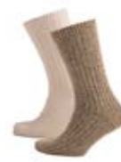
STONE / CREAM SOCK19