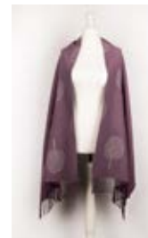
MULBERRY PURPLE SCAR-186