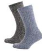
GREY / BLUE SOCK18