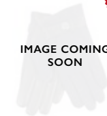
GREY HERRINGBONE GLOVE72