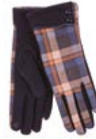
NAVY CHECK GLOVE19