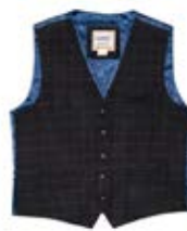
BLUE BOX CHECK WAIST01 M/ L/ XL