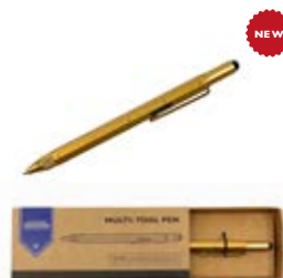
BRONZE PEN PEN37