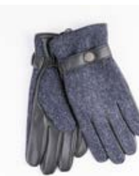
NAVY MELANGE GLOVE65