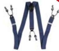
PLAIN NAVY HTBR05