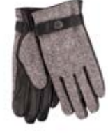
SALT & PEPPER GLOVE42