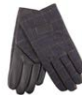
BLUE BOX CHECK GLOVE15