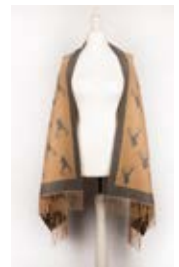
STAG CAMEL SCAR-204