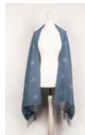
BUSY BEE BLUE SCAR-197