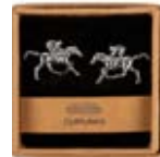
RACE HORSE HTCL04