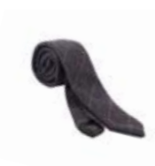
BLUE BOX CHECK TIE05