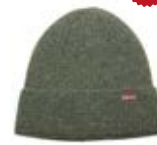
FOREST GREEN HAT-683