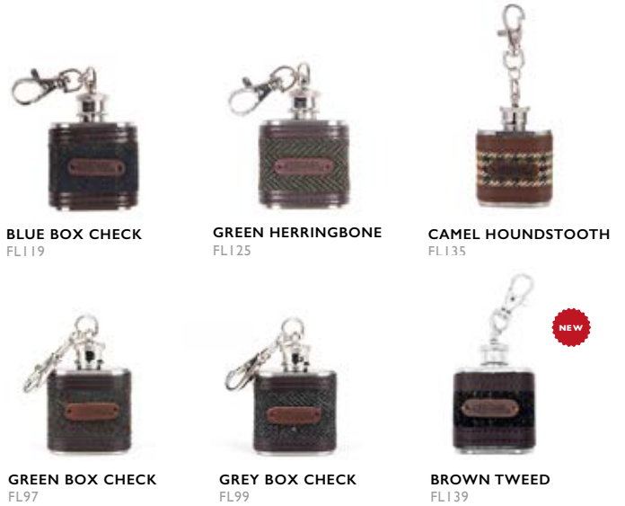
BLUE BOX CHECK FL119