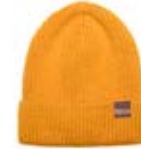
OCHRE YELLOW HAT-444