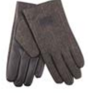
GREY HERRINGBONE GLOVE16