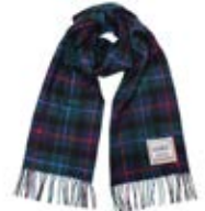
CAMPBELL OF CAWDOR CIG8-HT