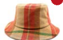
CAMEL CHECK HAT-663