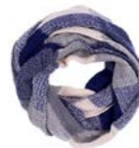
BLUE / GREY SNOOD17