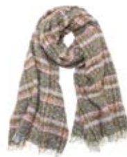
FOREST GREEN SCAR-124