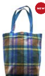
BLUE CHECK SHOPPER HTSH06