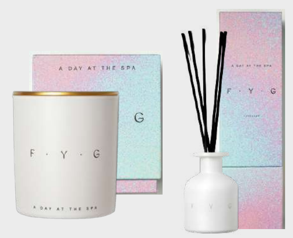
A Day At The Spa candle £35, fyghome.com

Memory: A local hidden gem: the English rose garden - liven your senses and indulge in this elegant scent, as you are transported to the sanctuary of a tranquil English rose garden in full bloom.