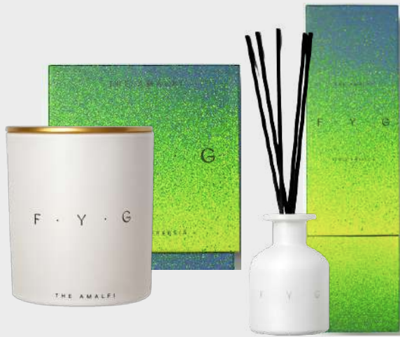
The Amalfi candle £35, fyghome.com