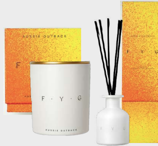
Aussie Outback candle £35, fyghome.com

Memory: Tennis season, London SW19 - a fun and fruity play on your senses and feel immediately transported to the pleasure of long summer nights during the British tennis season.