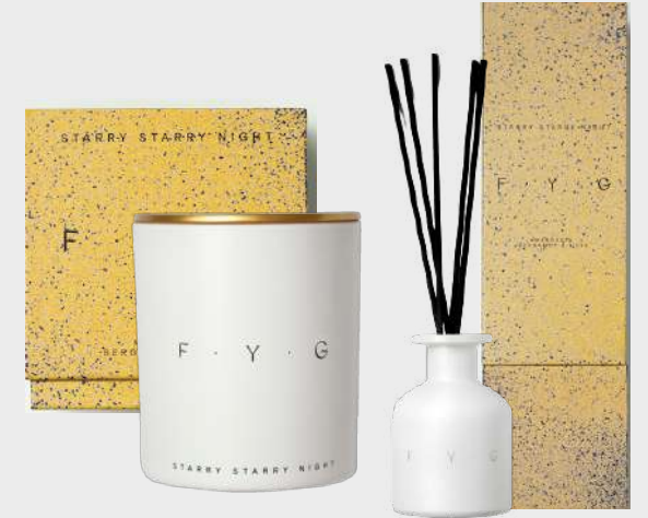
Starry Starry Night candle £35, fyghome.com

Memory: one to tell the grandkids: the Australian outback - positively stimulate and intrigue the senses, as you are transported to this Australian arid land.