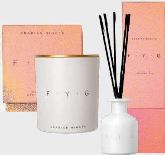
Arabian Nights candle £35, fyghome.com Arabian Nights diffuser £35, fyghome.com