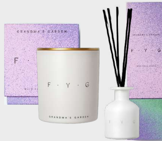
Grandma's Garden candle £35, fyghome.com Grandma's Garden diffuser £35, fyghome.com

Memory: Night time, the Arabian desert - be transported to a warm desert camp fire, breathing in the dry, fragrant air.