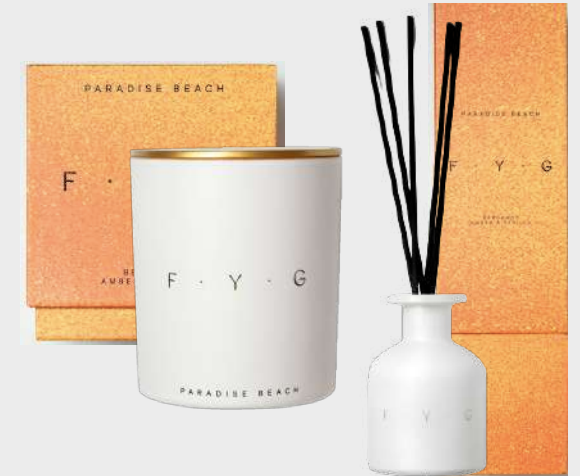
Paradise Beach candle £35, fyghome.com Paradise Beach diffuser £35, fyghome.com

Memory: Beach retreat, St Lucia - indulge in Caribbean beach vibes and prepare to feel yourself unwind.