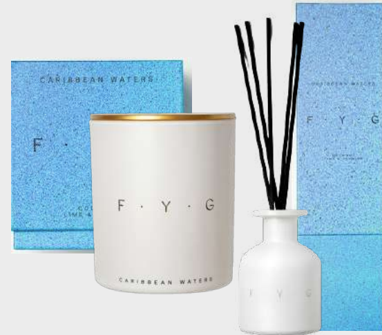
Caribbean Waters candle £35, fyghome.com Caribbean Waters diffuser £35, fyghome.com

Memory: Childhood summers spent in Thessaloniki, Greece - close your eyes and be transported to a bustling Greek garden, with ripe fig trees, laughter, love and sunshine.