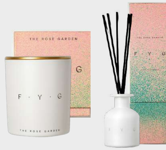
The Rose Garden candle £35, fyghome.com

Memory: Imperial Garden, Tokyo - connect to the calming peace, beauty and romance of a Japanese garden.