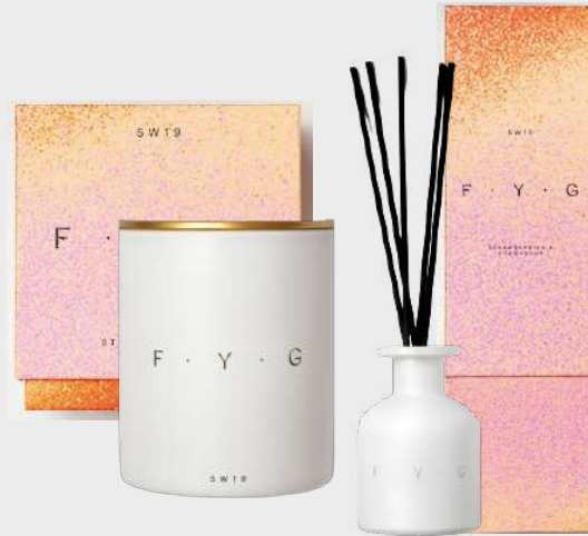
SW19 candle £35, fyghome.com

Memory: Beach-bound Sunday with friends – the perfect scent for a taste of breezy, carefree childhood days with fresh, salt sea air.