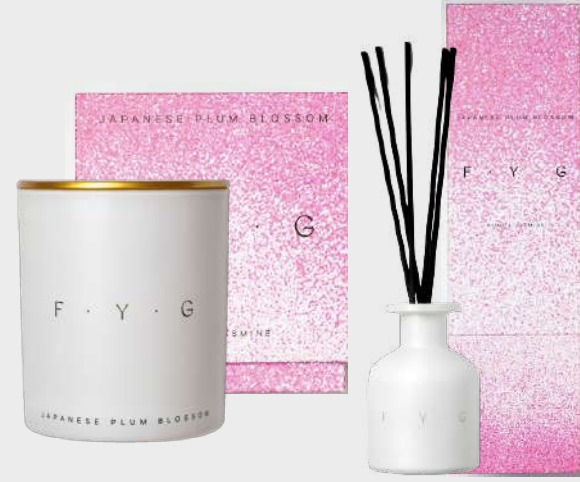
Japanese Plum Blossom Candle, £35 fyghome.com

Memory: Mini break to the romantic Amalfi coast Italy - invigorate your senses and be transported to the unrivalled beauty of coastal Italy.