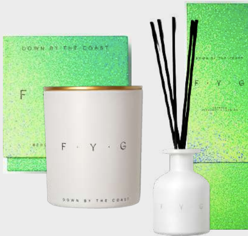
Down By The Coast candle, £35, fyghome.com