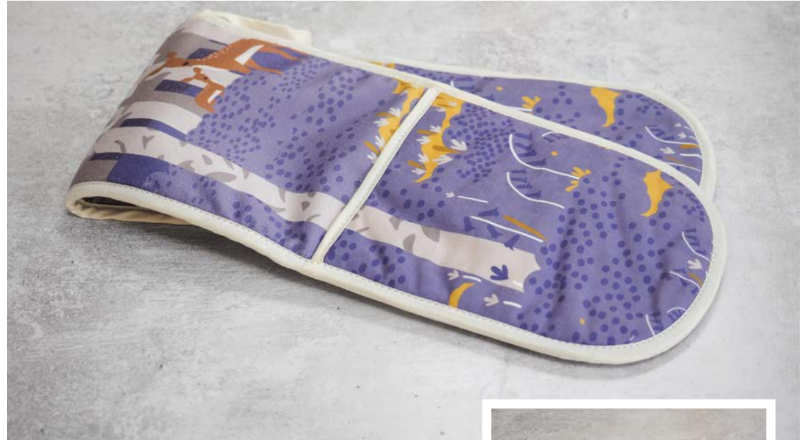
NEW DESIGN Double Oven Glove RRP £25.00