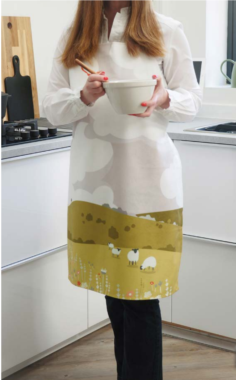
NEW DESIGN Rolling Hills Apron RRP £25.00