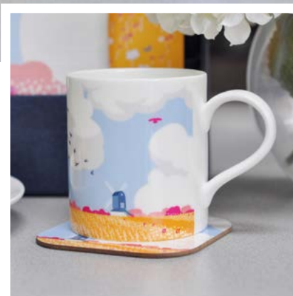
NEW DESIGN - Big Skies & Windmills