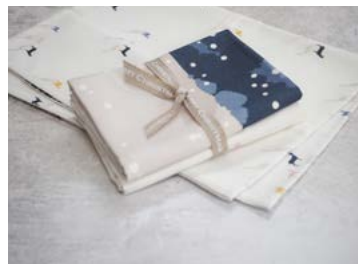
Set of 2 Winter Tea Towels - 1 winter village scene, 1 repeat deer in the snow print RRP £18.50