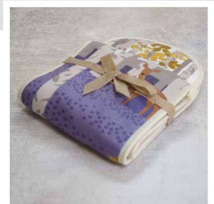
Folded into a neat parcel, tied with a ribbon with a swing tag