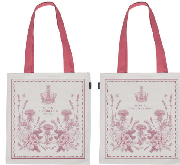
THE QUEEN'S COMMEMORATIVE CANVAS BAG CB34