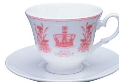
THE QUEEN'S COMMEMORATIVE CUP AND SAUCER CUP02