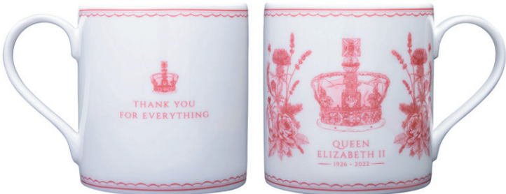
THE QUEEN'S COMMEMORATIVE MUG MU42