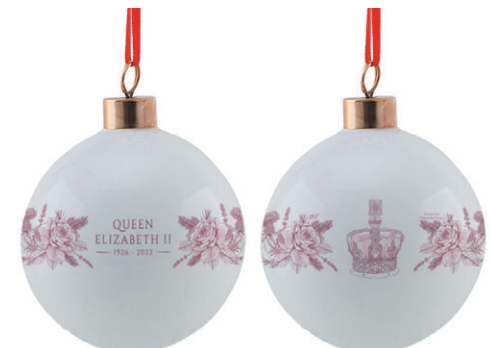
THE QUEEN'S COMMEMORATIVE BAUBLE BB10