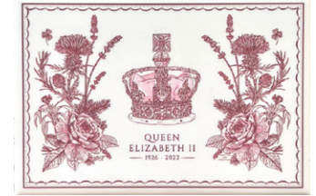
THE QUEEN'S COMMEMORATIVE MAGNET MAG12