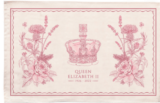
THE QUEEN'S COMMEMORATIVE TEA TOWEL TT74

Using traditional craftsmanship, up to 20 pairs of hands can be involved in making each product. This includes attaching each mug handle skillfully by hand.