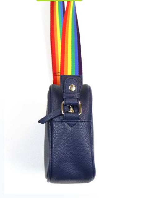
Our Vegan leather range of bags Camera bag RRP: £32.99 and Large Tote bag £39.99. Bamboo socks RRP £7.99