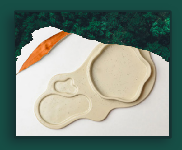
1 - WE USE SUSTAINABLE MATERIALS