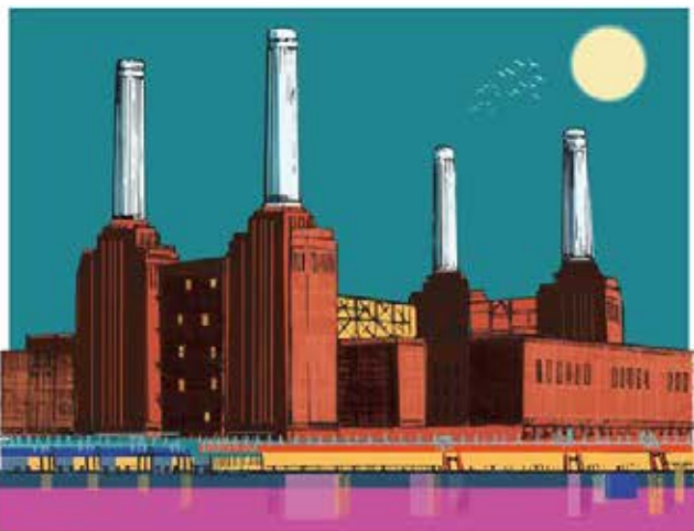
Battersea Power Station