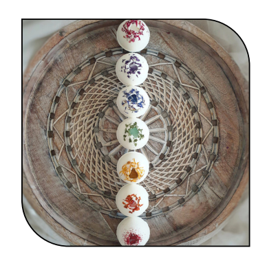
CHAKRA GIFT SET £19.90

You can also choose 6 for £15.90 or 8 for