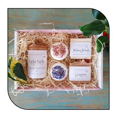
LARGET GIFT SET WITH SALT £15.90

with 1x Secret Bath Bomb, 1x soap and 1 65g bath salt.