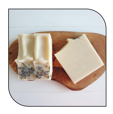
LAVENDER £3.90 (RRP £6.95)

with rosehip oil, french pink clay and pure geranium essential oil