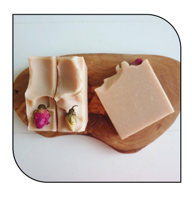
GERANIUM £3.90 (RRP 6.95)

with rosehip oil, french pink clay and pure geranium essential oil