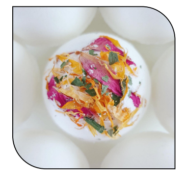
FLORAL RELIEF £2.95 (RRP £5.50)

with organic shea butter, organic coconut oil and pure geranium and ylang-ylang essential oils