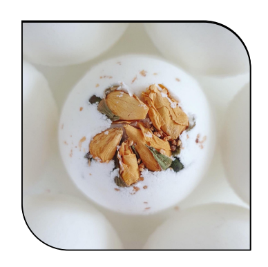
REBORN £2.95 (RRP £5.50)

with organic shea butter, organic coconut oil and pure geranium, maritime pine, ylang –ylang essential oils