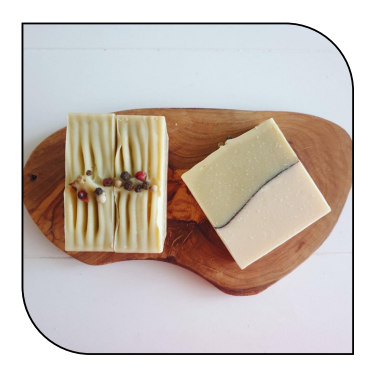
ROSEMARY & MINT £3.90 (RRP £6.95)

with raspberry seed oil, french red clay and poppy seeds