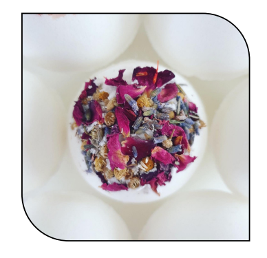
SWEET DREAMS £2.95 (RRP £5.50)

with organic shea butter, organic coconut oil and pure rose geranium essential oil