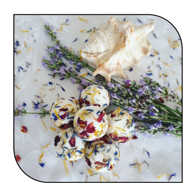
FLORAL £1.90 (RRP £3.20)

with lavender and rose geranium essential oils