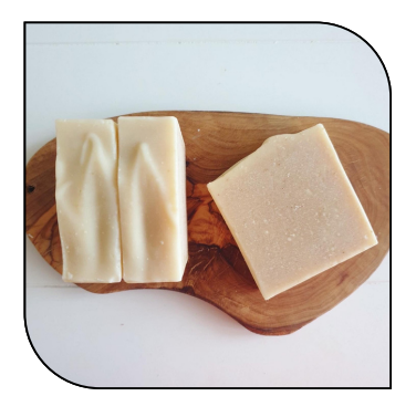
GENTLE (UNSCENTED) £3.90 (RRP £6.95)

woth organic honey, organic oat colloidal pure frankincense, lime and neroli essential oils (available between Sept-March)