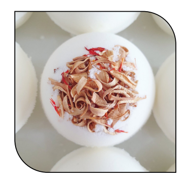
ORANGE CHOCOLATE £2.95 (RRP £5.50)

coconut oil and organic oatmeal colloidal