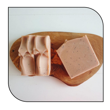
RASPBERRY SCRUB (UNSCENTED) £3.90 (RRP £6.95)

with only butters and oils fort he most sensitive skin