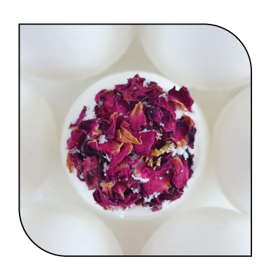
ROSE & SANDALWOOD £2.95 (RRP £5.50)

with organic shea butter, organic coconut oil and pure clary sage, juniper berry, lemon, lemongrass essential oils