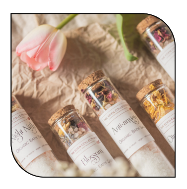
20X 65G BATH SALT £54.00