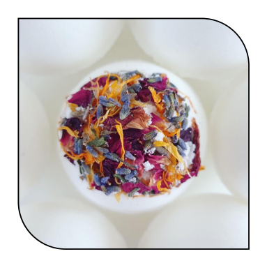
FLORAL £2.95 (RRP £5.50)

with organic shea butter, organic coconut oil and pure lavender essential oil