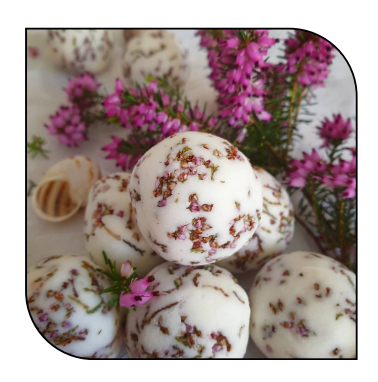
CALMING £1.90 (RRP £3.20)

with lavender and rose geranium essential oils