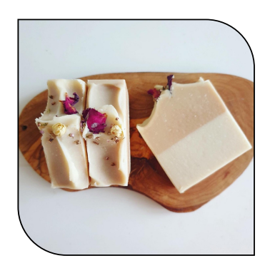
POSY £3.90 (RRP 6.95)

with coconut milk, cranberry powder, pure geranium, maritime pine and ylang-ylang essential oils (available between March-Sept)