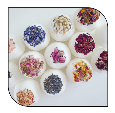
40X BATH BOMBS £118.00