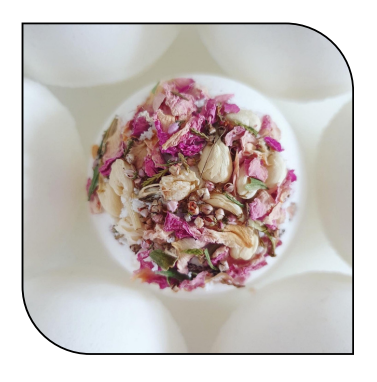
POSY £2.95 (RRP £5.50)

with organic shea butter, organic coconut oil and pure geranium, maritime pine, ylang –ylang essential oils