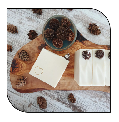
WINTER WOODS £3.90 (RRP £6.95)

with coconut milk, cranberry powder, pure geranium, maritime pine and ylang-ylang essential oils (available between March-Sept)