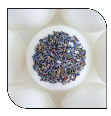
LAVENDER £2.95 (RRP £5.50)

with organic shea butter, organic coconut oil and pure lavender, ylangylang and cedar wood essential oils