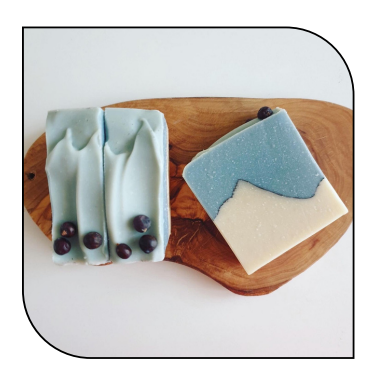
FOR HIM £3.90 (RRP £6.95)

Our soaps has a paper label around them. We will send it in tissue paper so you can keep them protected. Some of them are available in unique soap boxes, please let me know if you prefer to sell them in boxes.