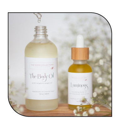
FACIAL OIL £6.90 (RRP £14.90) BODY OIL £9.50 (RRP £19.90)

Facial Oil Ingredients: watermelon seed oil, pomegarante oil, raspberry seed oil, organic hemp seed oil, safflower oil, vitamin E, geranium essential oil, lavender essential oil.