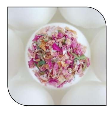
CHILDREN'S £3.60 (RRP £6.50)

with organic cocoa butter, organic coconut oil and pure sweet orange essential oil