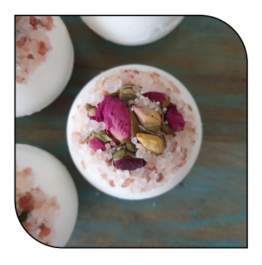
BLOSSOM £3.95 (RRP £7.95)

with organic shea butter, organic coconut oil and with or without pure essential oil