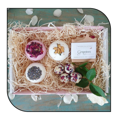
LARGE GIFT WITH BATH CREAMER £16.90

with 1x 300g bath salt, 2x Secret Bath Bombs and 2x soaps