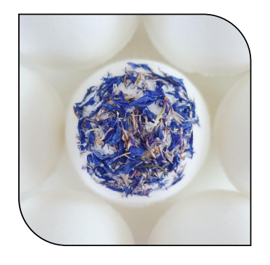
THREE BUTTERS (UNSCENTED) £2.95 (RRP £5.50)

with organic shea butter, organic coconut oil and pure rose geranium and sandalwood essential oils