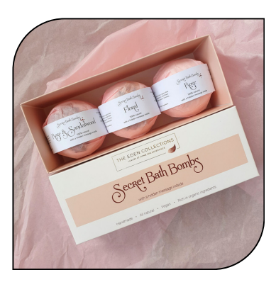
SET OF 3 CALMING, FLORAL OR CITRUS COLLECTION OF SECRET BATH BOMB IN GIFT BOX £8.90

Calming: 1x Lavender, 1x Sweet Dreams, 1x Floral Relief Floral: 1x Rose, 1x Rose & Sandalwood, 1x Floral Citrus: 1x Breathe, 1x Orange Chocolate, 1x Reborn