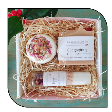
SMALL GIFT SET £8.90

made with chakra essential oils blends, decorated with healing crystals and hold a hidden affirmation inside