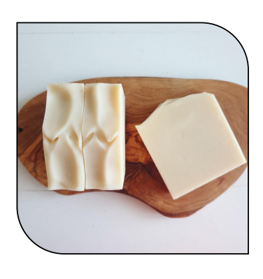
PURE (UNSCENTED, UNCOLOURED) £3.30 (RRP £5.90)

with french red clay, coconut charcoal, kaolin clay, pure lavender and benzoin essential oils