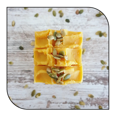
PUMPKIN SPA £3.90 (RRP £6.95)

with organic honey and organic oat colloidal