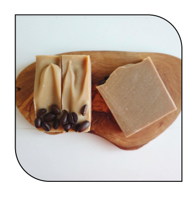
COFFEE £3.90 (RRP £6.95)

with aloe vera juice, french green clay, kaolin clay, pure rosemary and peppermint essential oils