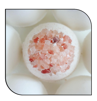
GENTLE (UNSCENTED) £2.95 (RRP £5.50) with organic shea butter, organic

with organic shea butter, organic coconut oil and pure lemongrass, sandalwood essential oils