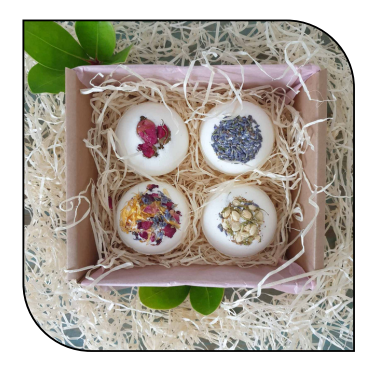
BATH BOMB GIFT SET FROM 4X £9.90

You can also choose 6 for £15.90 or 8 for