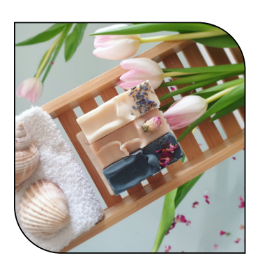
30X SOAPS £99.00