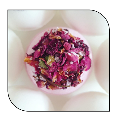
ANTI-ANXIETY £2.95 (RRP 5.50)

with organic shea butter, organic coconut oil and organic cocoa butter for the most sensitive skin