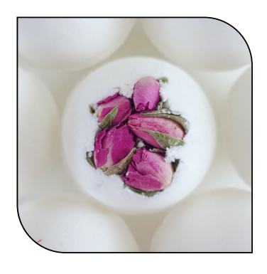
ROSE £2.95 (RRP £5.50)

with organic shea butter, organic coconut oil and pure rose geranium essential oil