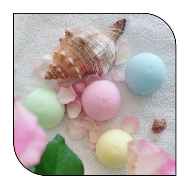
£3.30 (RRP £5.90)

Our Shower Steamers are all natural, with organic Epsom salt and pure essential oils. It comes in a bundle of 10 (£33.00) with mixed scents. If you have any questions feel free to contact me.