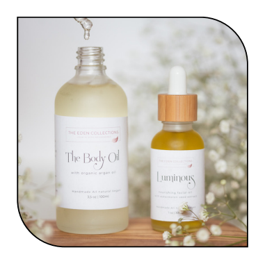
12X BODY & FACIAL OI £ 97.90