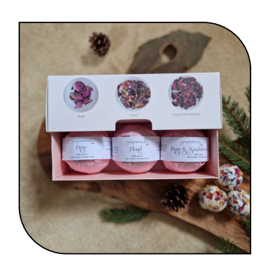
10X MIXED SET OF 3 BATH BOMBS IN BOX £ 99.00

5x Citrus, 5x Calming, 5x Floral Collections