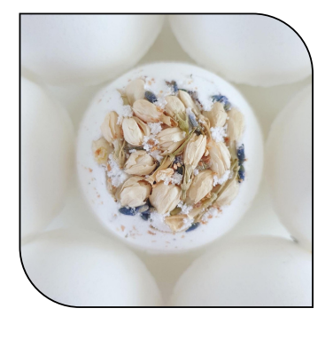
BREATH £2.95 (RRP £5.50)

with organic shea butter, organic coconut oil and pure clary sage, lavender, geranium, neroli essential oils