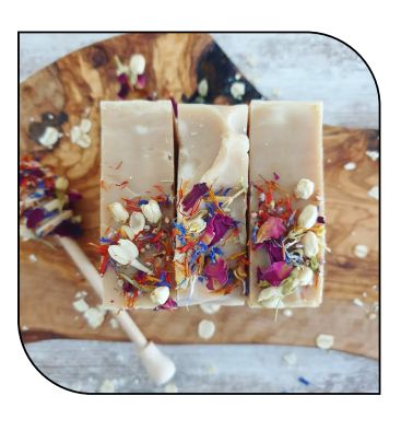
HONEY & OAT £3.90 (RRP £6.95)

with oat milk, indigo powder, pure bergamot and lavender essential oils