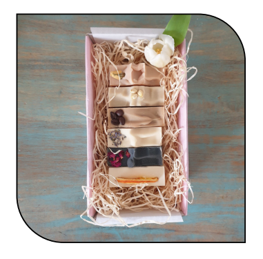
SOAP GIFT SET FROM 3X £8.90

with 3xSecret Bath Bombs, 4x bath creamers and 1x soap