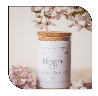
20X 300G BATH SALT £138.00