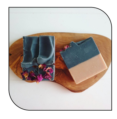
SUNSET £3.90 (RRP £6.95)

with coconut milk, kaolin clay and pure lavender essential oil