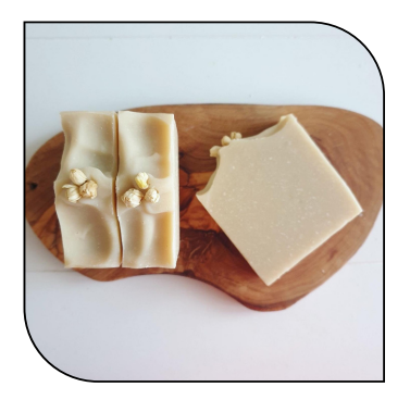
SUMMER TIME £3.90 (RRP 6.95)

with kaolin clay, pure frankincense and lemon essential oils (available between March-Sept)